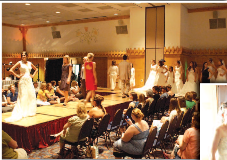
The fashion show featured a gorgeous array of specialty dresses, as well as tuxedos, beautifully presented by models wearing apparel provided by Petoskey Bridal, the Glass Slipper and Lavender & Old Lace.