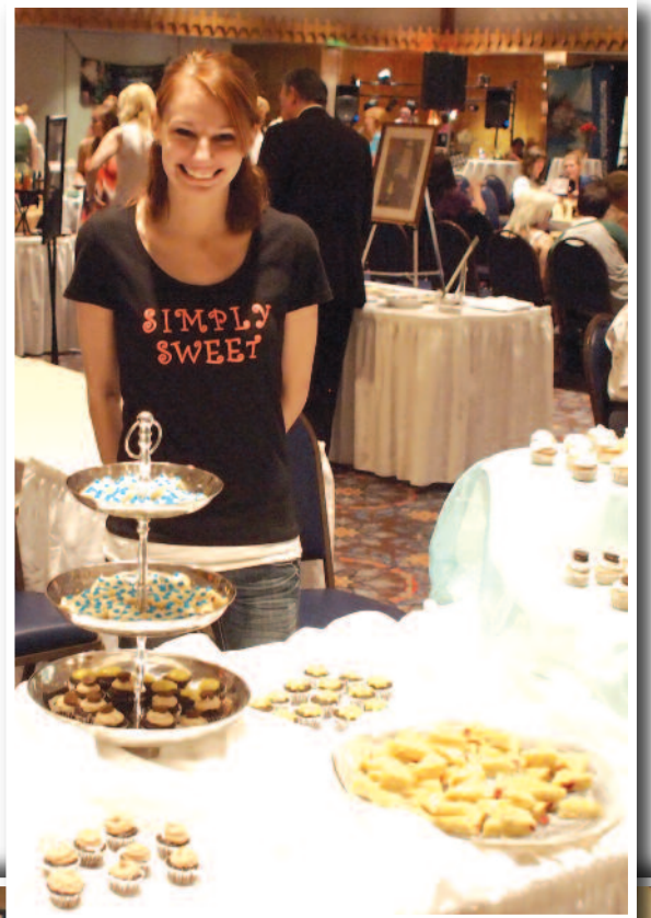
Weddings can be delicious, and among the vendors attending Sunday's Expo offering catering services were Simply Sweet (shown here), Birch Lake Cakes and Wisconsin Street Hall.

information about planning, catering, reception venues, music, dresses and tuxedo's, make-up and more.