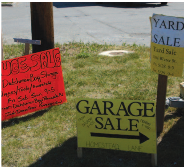
Bargain shoppers, mark those calendars and get ready to "explore the Breezeway" and "Shop till you drop" on May 25th and 26th between 9 am and 4 pm during the 3rd Annual Breezeway Garage Sale.

RIGHT: This weekend's Garage Sale event along the C-48 Breezeway will stretch across the 26 mile route from Atwood to Boyne Falls.