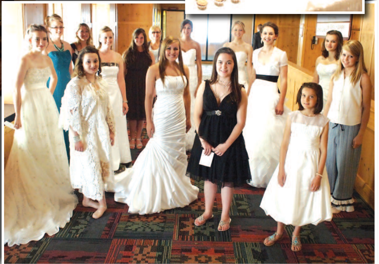
Bring on the brides! Several lovely ladies volunteered as models for the fashion show portion of last Sunday's Wedding Expo event.

The 2012 Wedding Expo at Boyne Mountain Resort was a wonderful success, drawing scores of brides-to-be and even a few groom to gather valuable information about planning their wedding event.