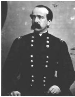
Union Brigadier General Daniel Butterfield

This Memorial Day, services held across the Nation for the countless American servicemen and women who have passed will conclude with a lone bugle sounding the heartfelt refrains of Taps. It is a melody that is all too familiar, and continues to comfort and remind us all of the sacrifices so many have made to ensure our American freedoms.